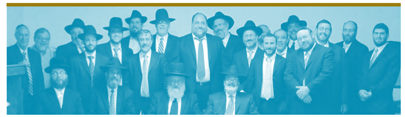
Attendees of STAR-K'S recent Hakaras HaTov dinner acknowledging local area foodservice mashgichim and mashgichos (not pictured).

NON PROFIT ORG US POSTAGE PAID STATEN ISLAND NY PERMIT #835